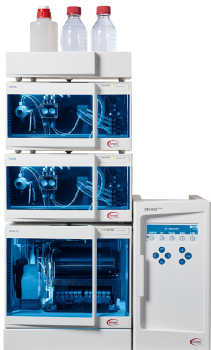
Figure 1: ALEXYS analyzer for Tobramycin.

The analysis of the byproduct contribution in bulk tobramycin and preparations is important as to insight in stability, quality control and authenticity. A number of qualitative and quantitative methods has been published so far [1] but the focus is mainly on tobramycin and not on the by-products. Because of the presence of sugar groups in both tobramycin and by-products LC with pulsed amperometric detection (PAD) is a highly selective and sensitive analytical tool [2].